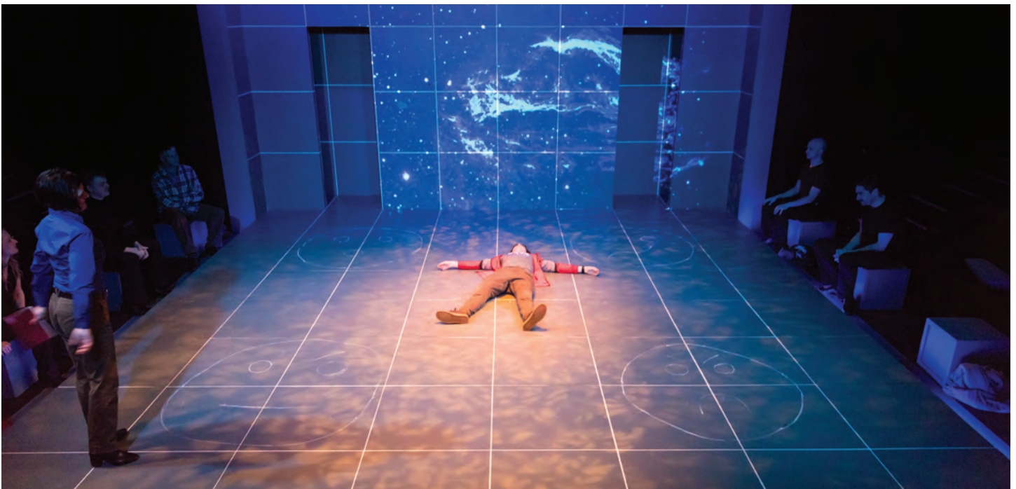
Pictured: a scene from the show. Siobhan, the teacher, is on the left, watching Christopher lay down in the center of the floor. Other cast members watch from the far left and far right sides. A projected image of a galaxy appears on the back wall.

Parking: Some on-street parking is available on several blocks surrounding the theatre. Two city-owned parking garages, fully-lit and with 24-hour security, are located just 1/2 -block west of our home. The garages are accessed from Charnelton St., beneath the Broadway North and Broadway South apartment buildings, respectively. Both garages are open to the public, and they are free on evenings (after 6pm) and all weekend.