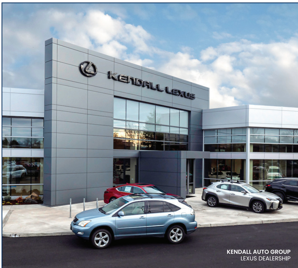
KENDALL AUTO GROUP LEXUS DEALERSHIP